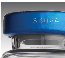
Ablation of alphanumeric text

Vials remain a leading packaging solution for liquid dosage forms, especially for vaccines, where the packaging aids safe and sterile dispensing. To help ensure safety throughout the distribution chain, code quality and accuracy is critical. Vials can be marked with GS1-DataMatrix or alphanumeric codes on the closure or top of the vial cap, as well as on the bottom. Invisible codes, printed with UV ink, allow for internal traceability without the code being visible at the point of use. Marking vials with ink-based technologies might be challenging in the case of vaccines, because they must be stored in a temperature-controlled environment to avoid decrease in potency and effectiveness from the time they are manufactured until they get administered. During the manufacturing, packaging, and distribution in a cold chain environment, codes may not adhere throughout without smudging.