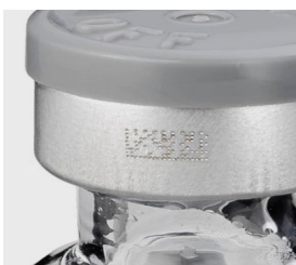
Engraving of a 2D DataMatrix code

Marking internal traceability information on vial caps is inherently challenging due to their small size and curved shape. The codes need to be legible and accurate, even after vials are subjected to a sterilization process or passed through cold-chain-distribution. Due to the small space in vial handling systems such as a star wheel, integrating a marking solution while still having the power and precision to mark small DataMatrix or alphanumeric codes at high speeds is challenging.